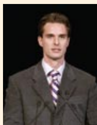
Without Lighting Kit