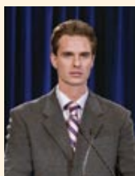
With Lighting Kit