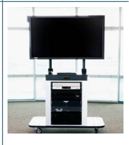
Rates subject to change without notice.

All audio visual components are subject to add-on fees for additional components required for the items such as locks, stands, cabeling and draping, etc.