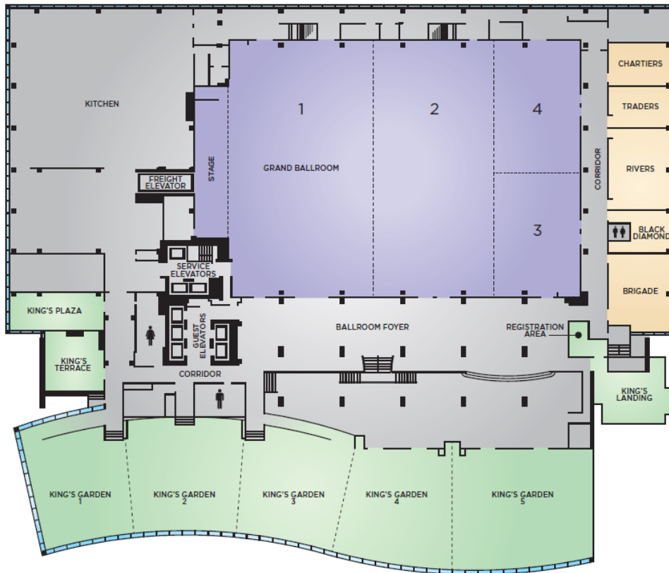
WYNDHAM GRAND | BALLROOM LEVEL PITTSBURGH DOWNTOWN