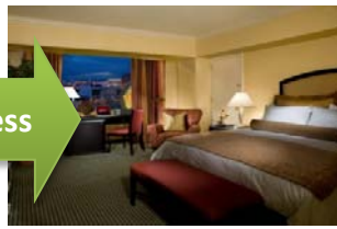
Book Hotel Room (GroupMAX reservations)