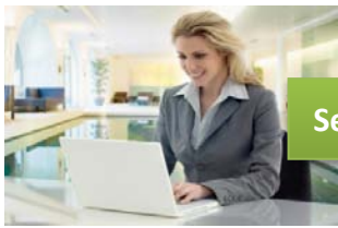
Register for Event (Any registration system)